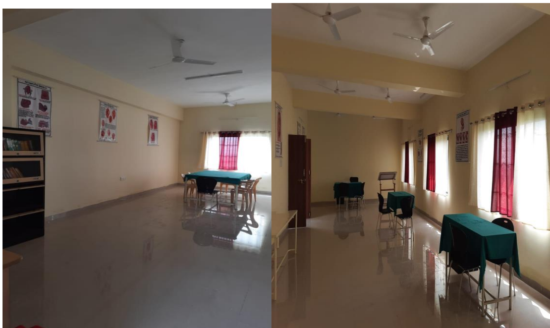
Departmental Library Departmental Tutorial Room